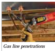
Gas line penetrations

A typical 2,500 ft 2 home has over 1/2 mile of cracks and crevices. – Air Barrier Association of America