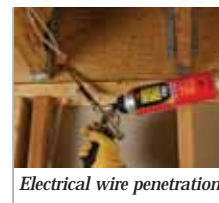
Electrical wire penetrations

Use GREAT STUFF PRO™ Gaps & Cracks Insulating Foam Sealant to seal and insulate around common areas of energy loss such as foundation/sill plate, outdoor fixtures, pipe penetrations, attic and more.*